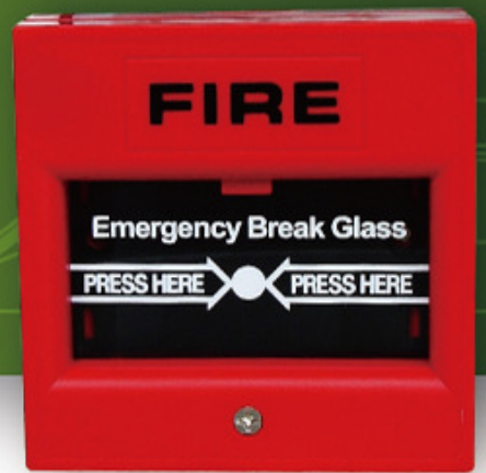
NÚT NHẤN KHẨN CẤP CM-FB116